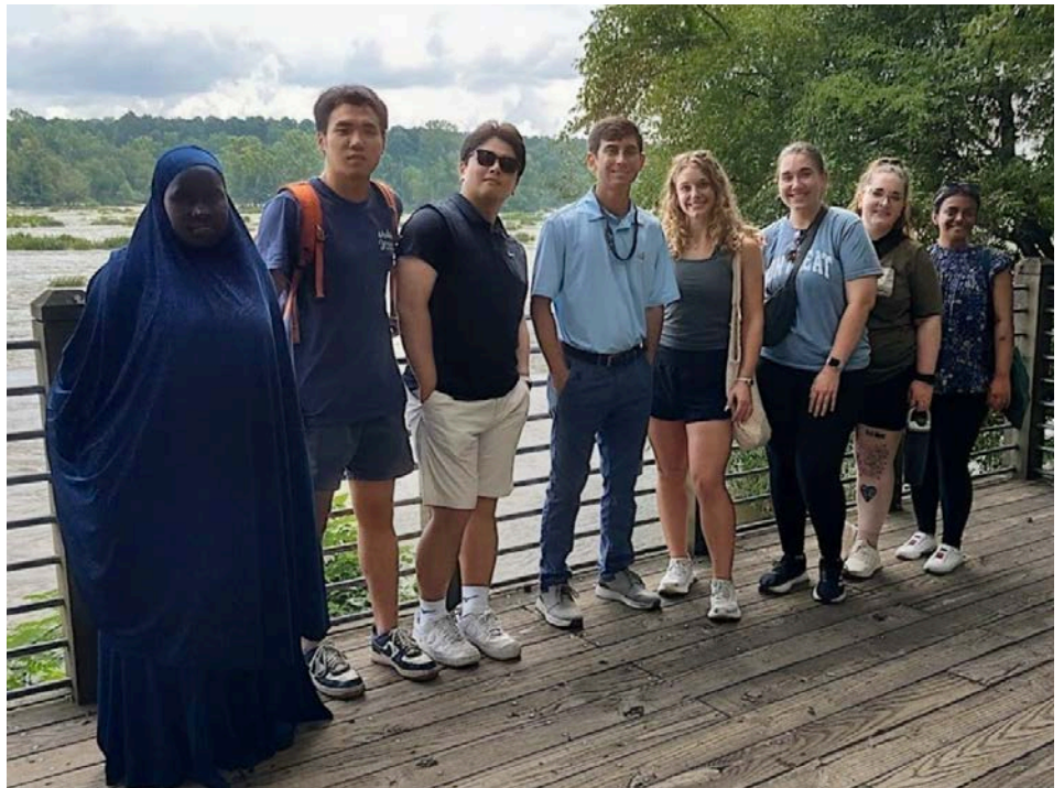
Graduate students exploring South Carolina's Piedmont region.