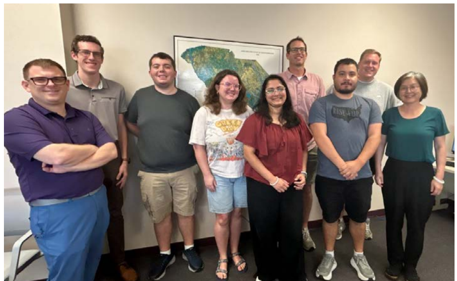
Undergraduate students gather at the Department of Geography's Welcome Back event, August 2025.