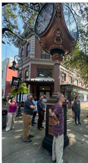
USC Geography faculty exploring Columbia's urban landscapes during this year's Fall Faculty Retreat.

Dear Students, Colleagues, Alumni, and Friends,